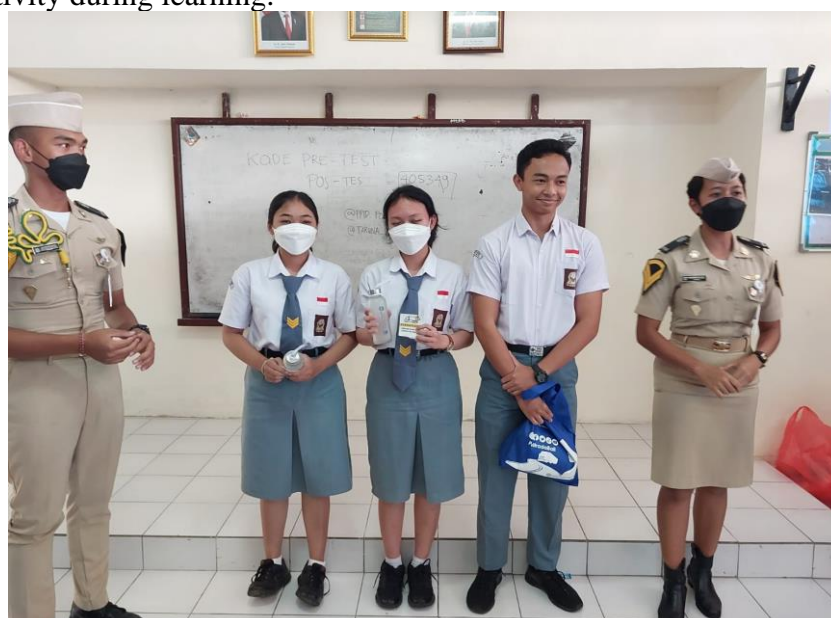
Figure 9. Awarding the Best Three Participants

Participants actively participate in activities. This is marked by an attractive class condition during discussions and questions and answers. At the end of the activity, souvenirs were handed out to the 3 (three) best participants. The best participants are selected based on test results and activity during learning.