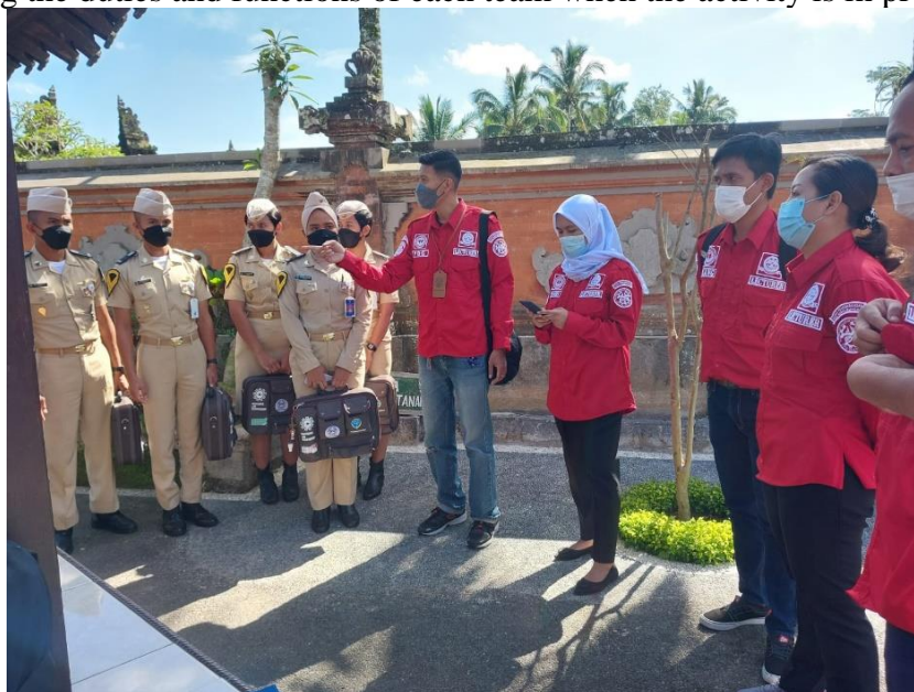
Figure 3. Briefing before the activity takes place

On the day of implementation, it begins with the provision of information and briefing to the team that will carry out the socialization. This briefing is carried out for the smooth running of activities regarding the duties and functions of each team when the activity is in progress.