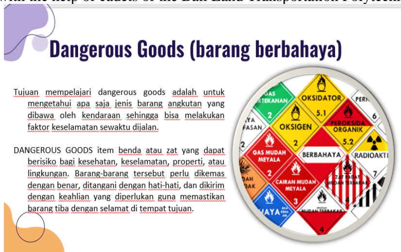
Gambar 1. Barang Berbahaya

After the briefing by the committee team, each member prepares to take their respective positions. The target class in the implementation of this socialization is class XII IPA. The lecturer explained the material using ppt with the help of props in the form of a placard of dangerous goods with the help of cadets of the Bali Land Transportation Polytechnic.