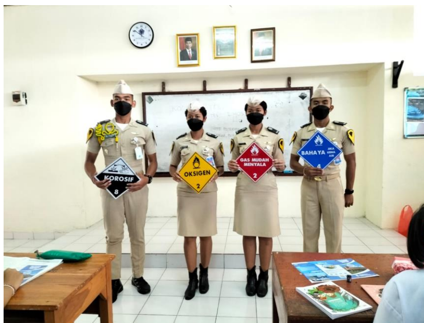
Figure 5. Use of Practice Materials in the Form of Placard Dangerous Goods

After learning in class, a question and answer session was held. It is used to increase students' curiosity about the cargo of dangerous goods. At the end of the activity, a group photo was taken and souvenirs were given with the Principal of SMA Negeri 1 Baturiti.