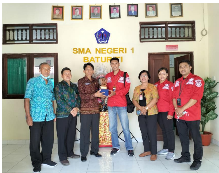
Figure 6. Giving souvenirs to SMA Negeri 1 Tabanan