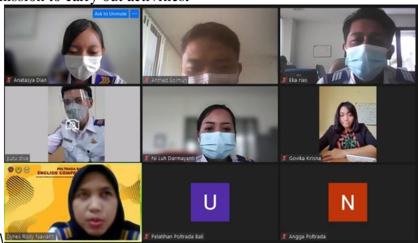
Figure 2. Committee Coordination Meeting

The preparation stage begins with a committee coordination meeting for the location and time of implementation. After being determined, the committee contacted SMA Negeri 1 Baturiti to request permission to carry out activities.